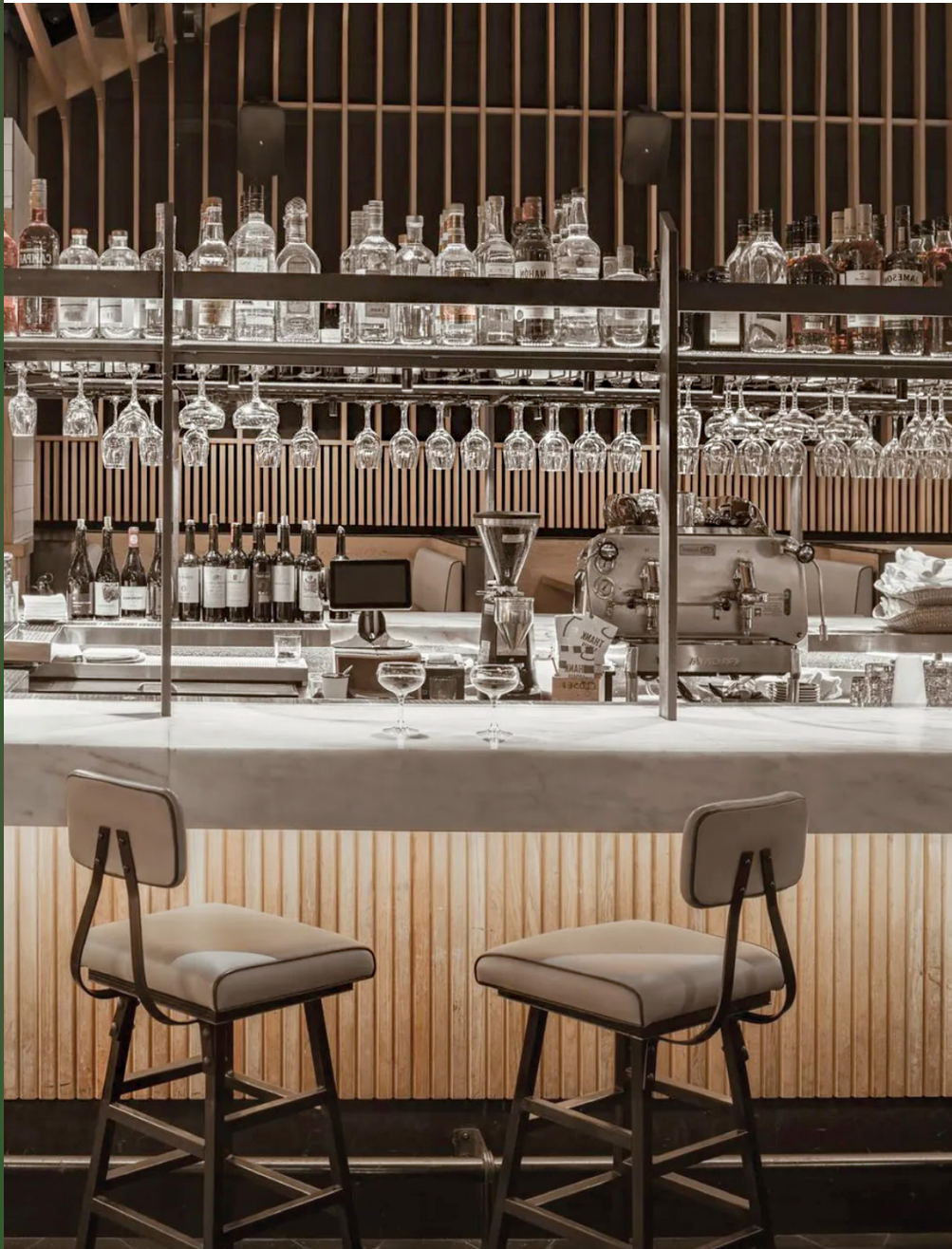
SOLID WOOD TAMBOUR Bar: Solid wood in white oak

TAMBOUR is a grooved/slatted wood product designed for vertical, horizontal and diagonal interior installations. Available in a range of domestically sourced wood species and supplied on patented flexible latex paper backing for an easy installation. The material can be used for walls, ceilings, concave and convex installations and is perfect for columns. Material is supplied unfinished. Available finish options include stain, paint, oil, or urethane.