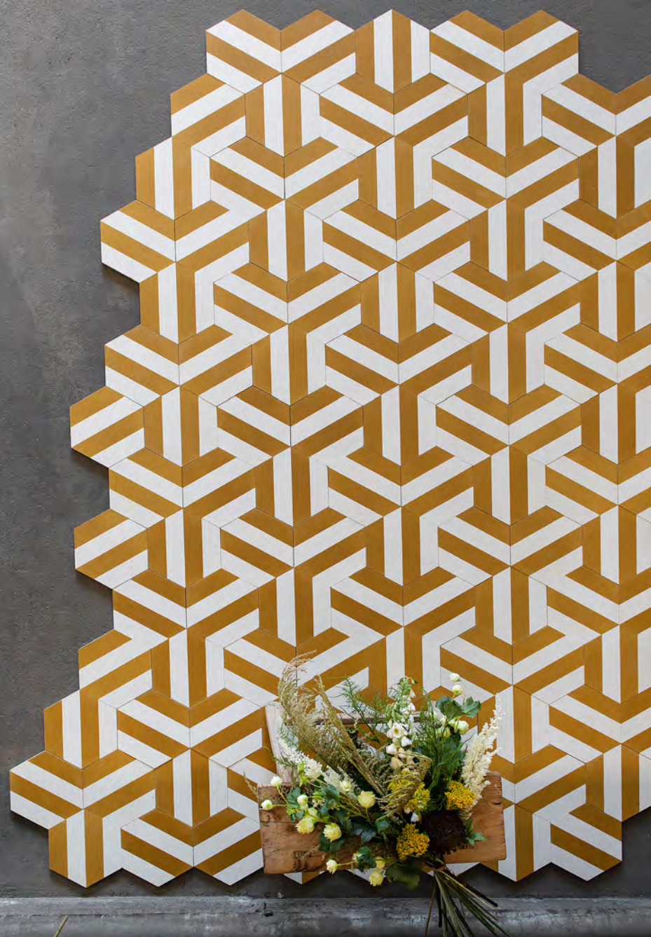
Kimono B - honey/pure white by Claesson Koivisto Rune