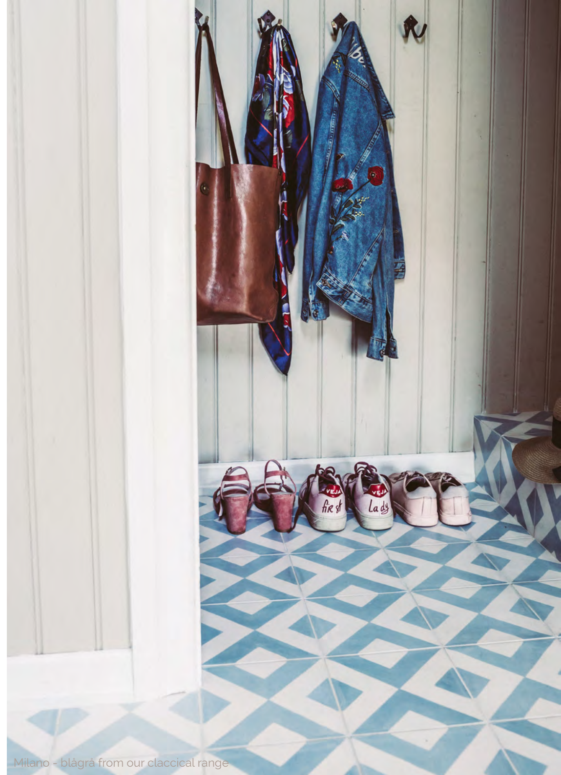
Milano - blågrå from our claccical range