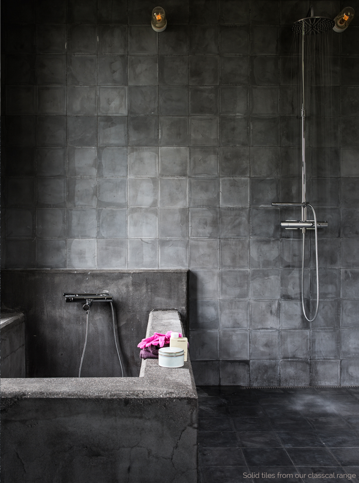
Solid tiles from our classcal range