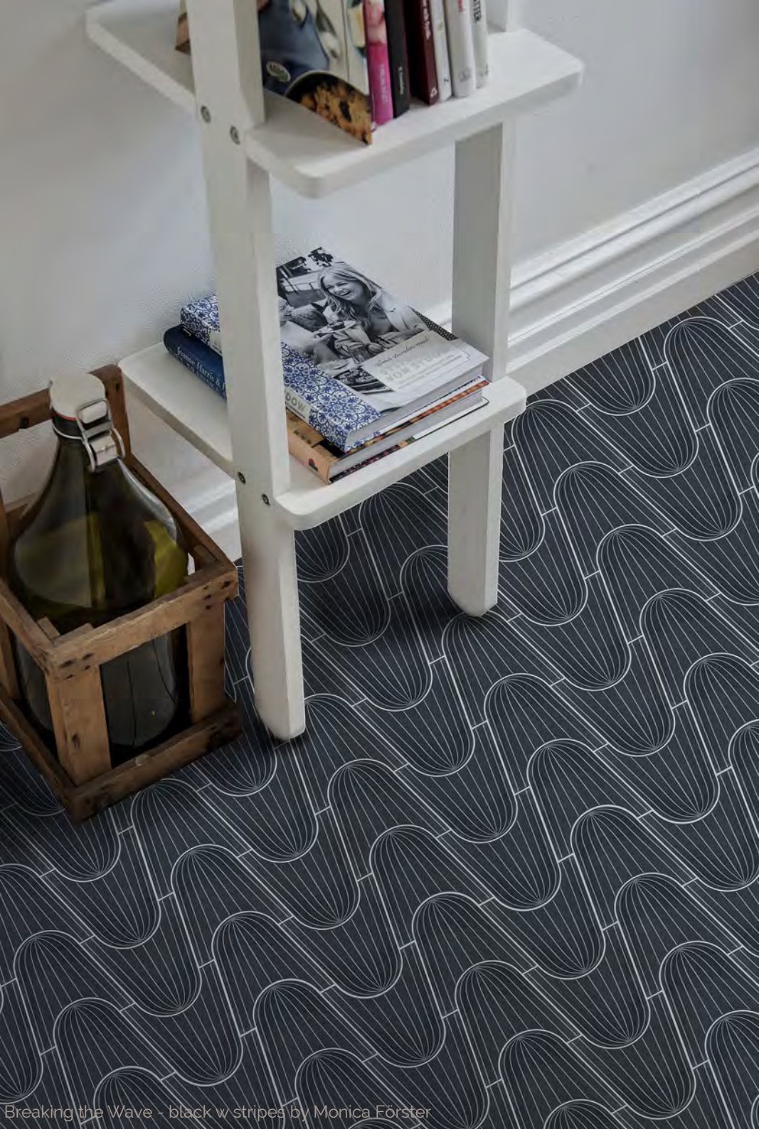
Breaking the Wave - black w stripes by Monica Förster