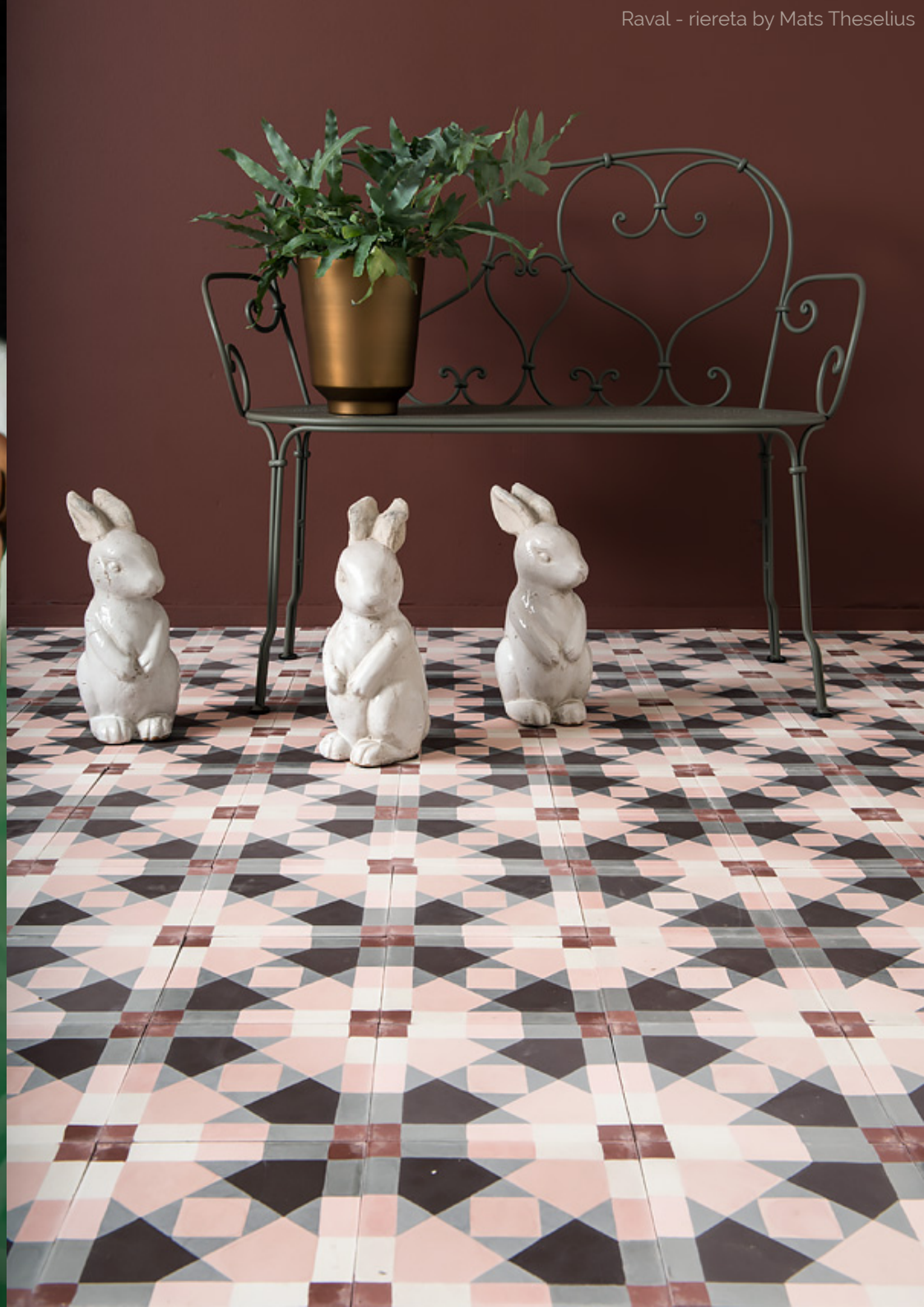
Raval - riereta by Mats Theselius