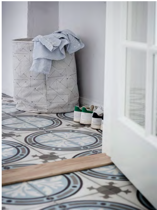
Provence - herrgård from our claccical range

Besides our design collaboration we also carry a classical range with traditional patterns and plain coloured cement tiles. The colours in these patterns have been adapted to suit the typical Scandinavian taste.