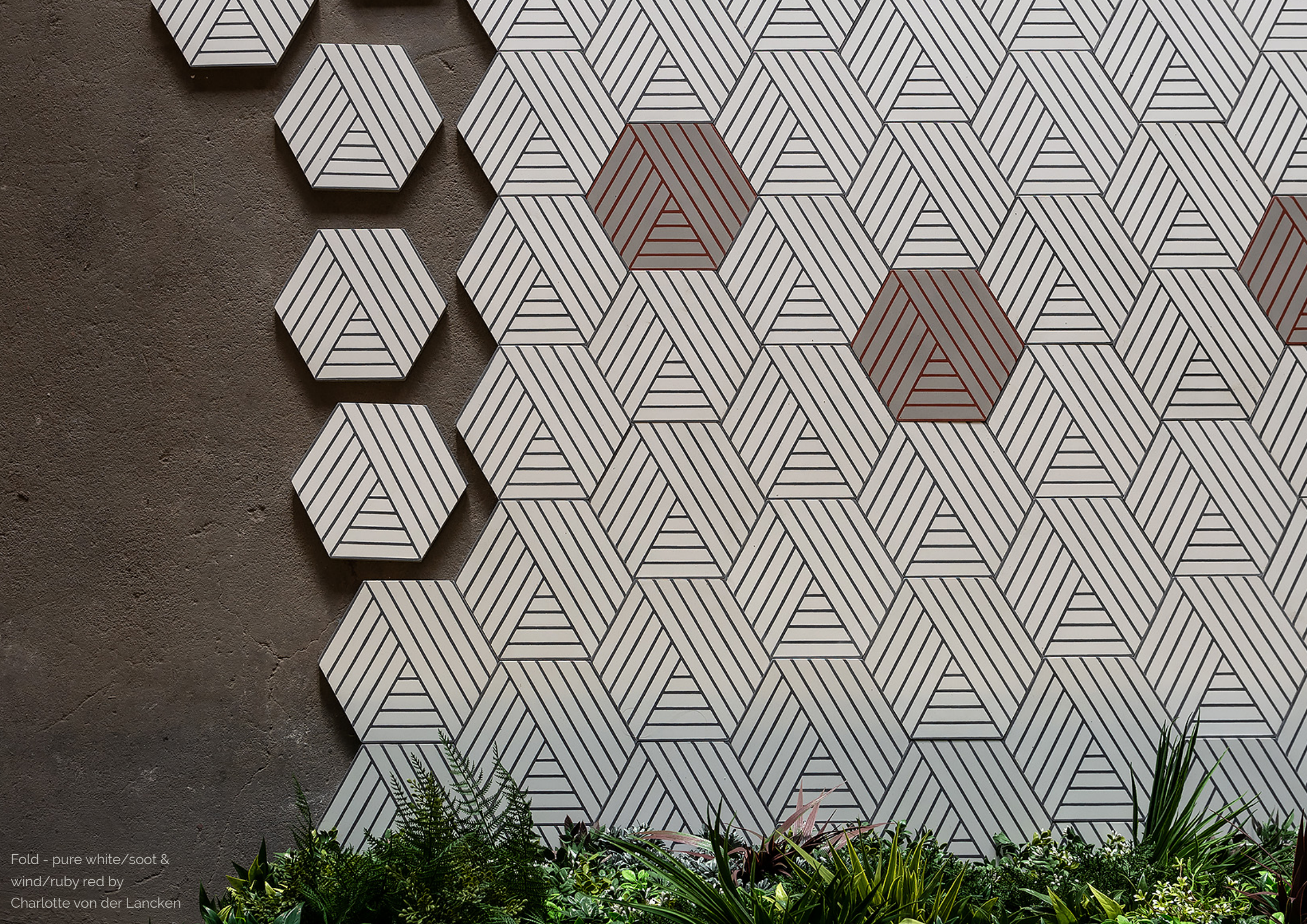
Fold - pure white/soot & wind/ruby red by Charlotte von der Lancken