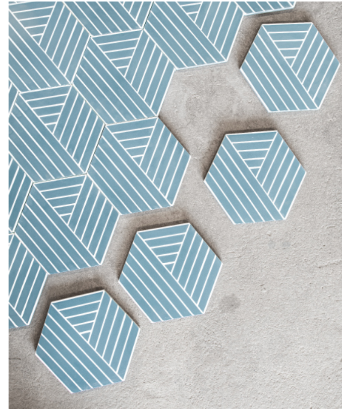
Fold - pigeon blue/pure white by Charlotte von der Lancken