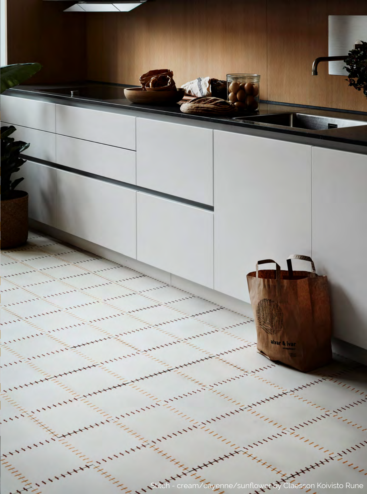
Stitch - cream/cayenne/sunflower by Claesson Koivisto Rune