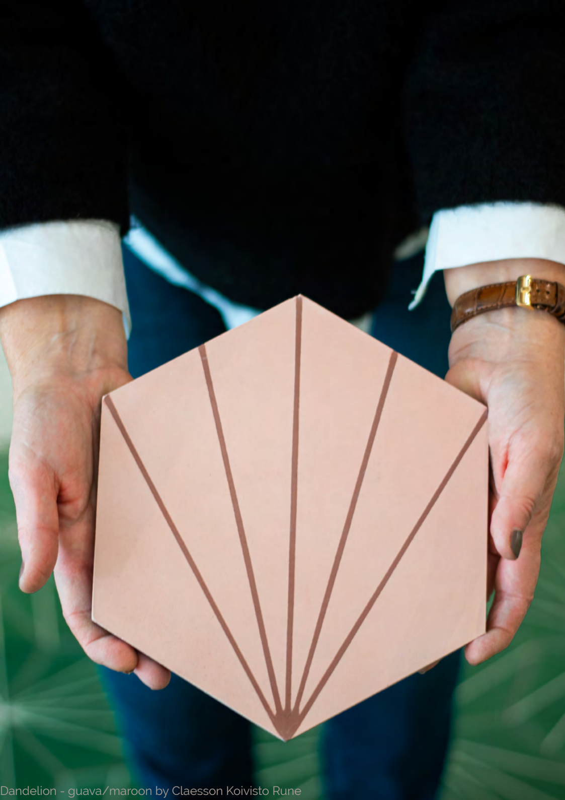
Dandelion - guava/maroon by Claesson Koivisto Rune