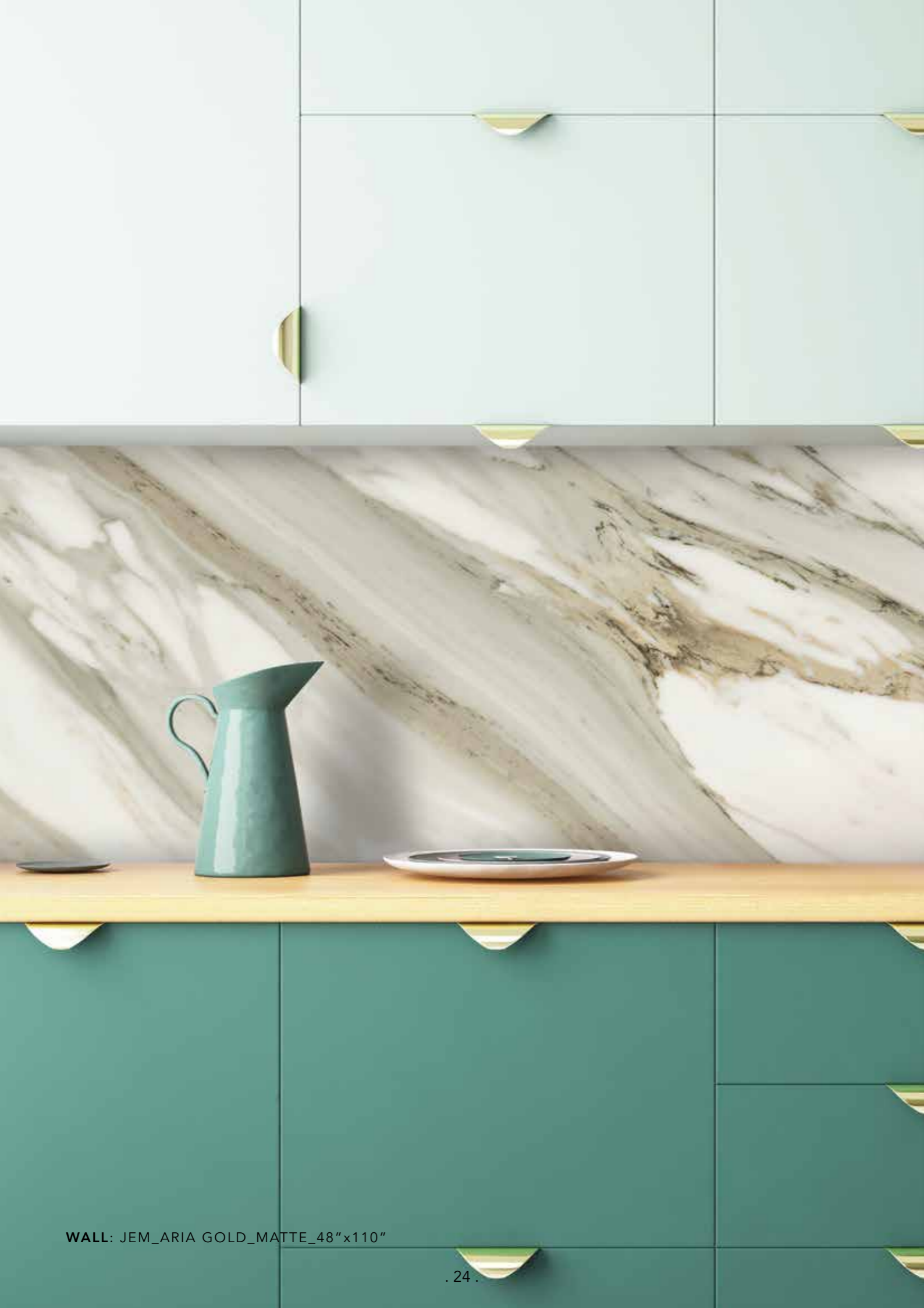
WALL: JEM_ARIA GOLD_MATTE_48"x110"