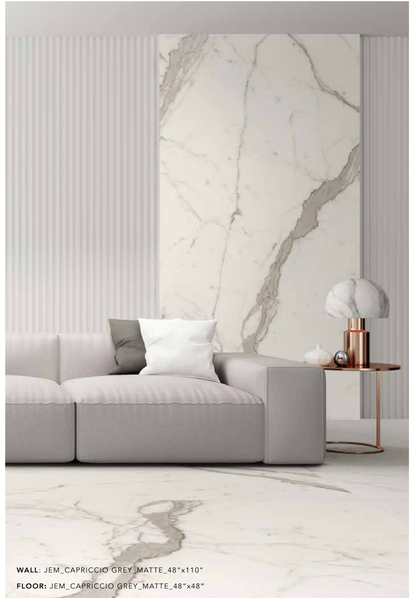
WALL: JEM_CAPRICCIO GREY_MATTE_48"x110"