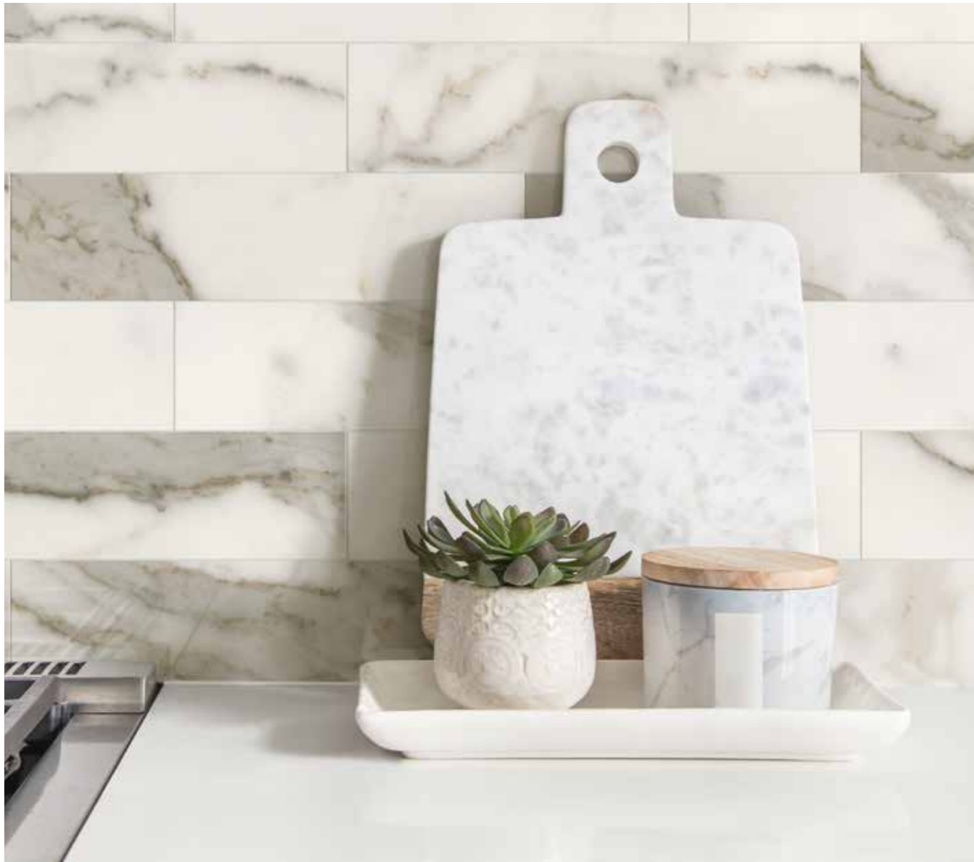
WALL: JEM_CAPRIGGIO GREY_POLISHED_3"x12"