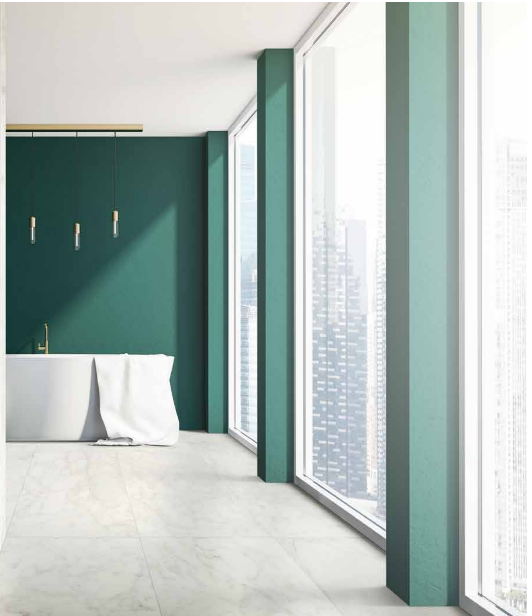
FLOOR: JEM_ADAGIO WHITE_MATTE_24"x48"