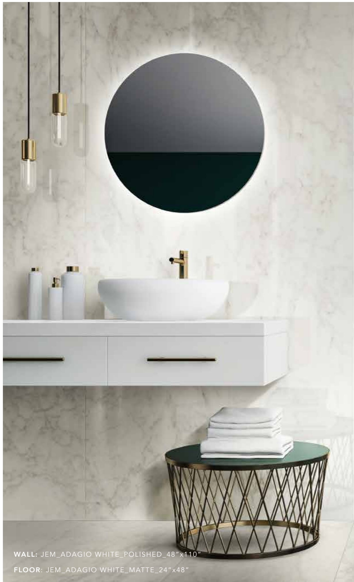
WALL: JEM_ADAGIO WHITE_POLISHED_48"x110"