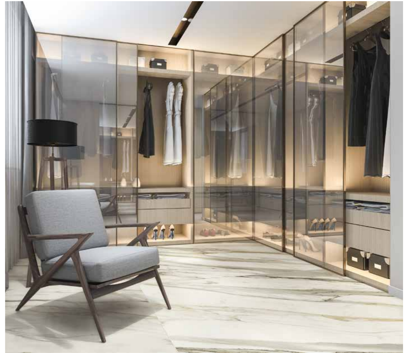
FLOOR: JEM_ARIA GOLD_MATTE_48"x48"